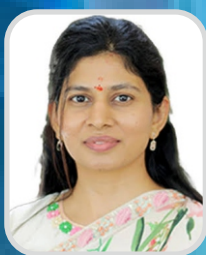
Smt. Raksha Nikhil Khadse Hon'ble Youth Affairs & Sports Minister of State