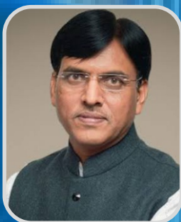
Dr. Mansukh Mandaviya Hon'ble Youth Affairs & Sports Minister

Funded by Ministry of Youth Affairs & Sports